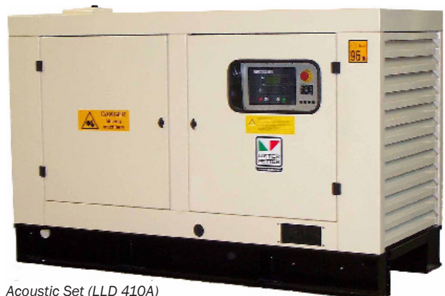
Acoustic Set (LLD 410A)